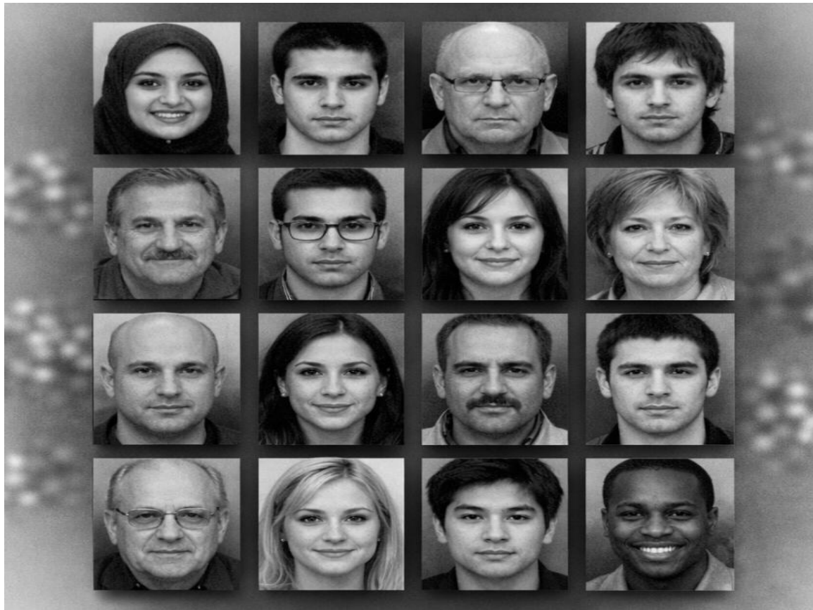
Figure 2: Sample face images projected onto the Fisherfaces subspace, showing clear separation among different individuals.

The Fisherfaces approach has been widely adopted in academic research and practical applications due to its ability to handle variations in illumination, facial expressions, and minor pose changes effectively. By emphasizing discriminative features rather than overall variance, the method improves recognition accuracy, especially when dealing with challenging real-world datasets. Figure 2 illustrates sample face images projected onto the Fisherfaces subspace, highlighting the clear separation among different individuals and providing a visual understanding of the method's discriminative power.